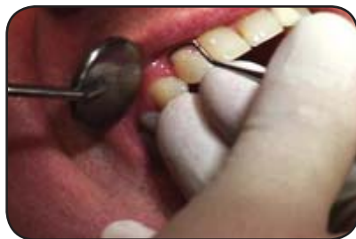
Removing plaque below the gumline