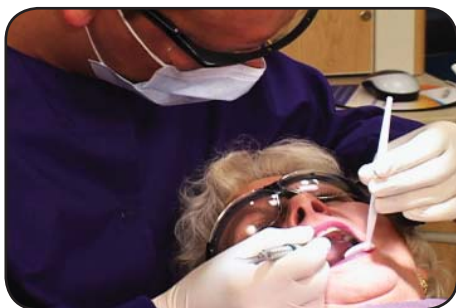
Scaling & root planing exam

The goal of scaling and root planing is to eliminate the source of periodontal infection.